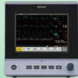
X8 Patient Monitor