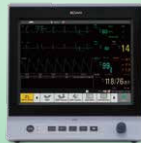
X12 Patient Monitor